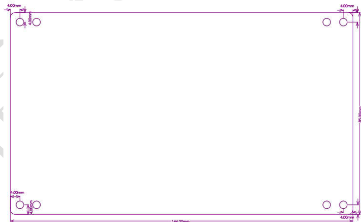
General structure size